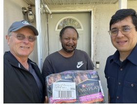
Rotary on the Road